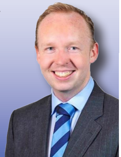
Noel ROCK TD, Dáil Éireann, Ireland

I would encourage any eligible national Parliament Member to consider participating in this programme.