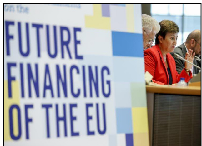
Kristalina Georgieva, Vice President of the European Commission

In her concluding remarks Kristalina Georgieva , Vice-president of the European Commission, noted that a majority of the participants recognized the need for the modernisation and simplification of the EU budget. In the eyes of the Commission this should not be a “ European tax ”, but it should allow citizens to be linked more directly to the objectives of the Union. Mario Monti , Chairman of the High Level Group on Own Resources, rounded-up the discussion by underlining the increased pressure on Europe and called on the Council to take action and reform the own resources of the European budget.