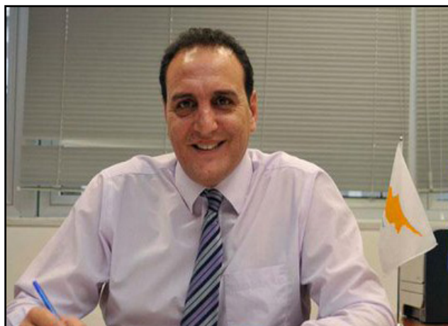
Onoufrios Koulla MP, Member of the Committee on Financial and Budgetary Affairs in the Cypriot House of Representatives

The Eurozone is an imperfect currency area, and the dialogue within the European Semester cycle helps coordinate economic policies at national and European level and supports addressing the macro-economic imbalances. In this context, Onoufrios Koulla MP