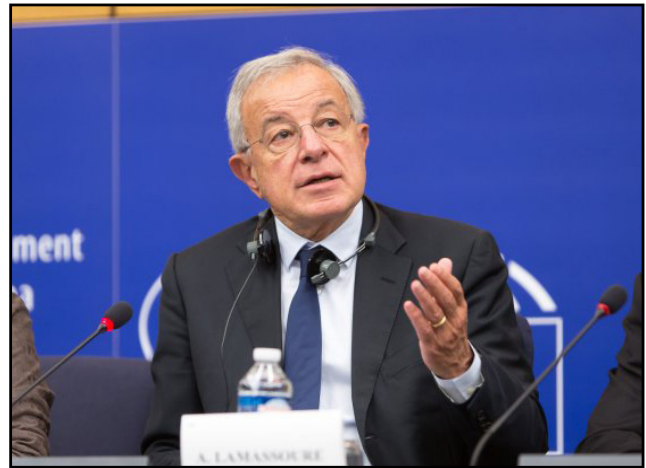
Alain Lamassoure MEP (FR), Member of the High Level Group

tries in question reach the necessary convergence level, we should develop smooth mechanisms in order to move beyond this policy provision.