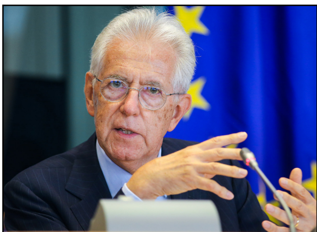
Mario Monti, Chairman of the High Level Group on Own resources

During the inaugural session of the Conference on the Future of Financing of the European Union, the Chairman of the High Level Group on Own resources, Mario Monti , opened the debate with a succinct description of the state of play. Rather than resulting in integration the MFF rounds and the budgetary talks “predisposed the EU towards disintegration, as they shed light on the differences amongst Member States. Little is being done to highlight the positive and most often unperceived benefits resulting from these debates.”