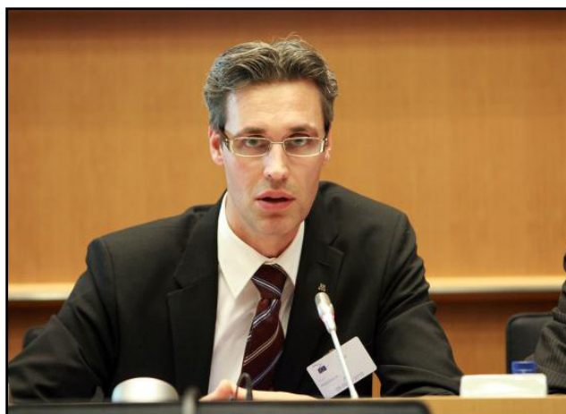
Jörgen Andersson MP, Member of the Committee on Finance in the Swedish Riksdagen

During the first thematic debate on the different sources of revenue that make up the current budget, Jörgen Andersson MP (Moderate Party, SE), Member of the Committee on Finance, reminded the audience that Sweden is rather sceptical of some of the elements in the report. For example, the Swedish parliament does not consider the removal of fiscal competencies from the national level as appropriate. When it comes to the size of the budget, Mr Andersson believes strongly that through growth more money will be made available to the EU.