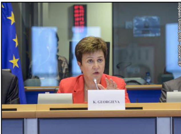
Kristalina Georgieva, Vice President of the European Commission

Vice-President of the European Commission, Kristalina Georgieva , responsible for the European budget also intervened during this session by reminding the participants of the success of the EU cohesion policy. “To date, this policy has helped six countries that were considered low income countries to become high-income countries (by passing the middle-income gap), and has created huge investment opportunities for all other Member States“.