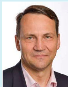
Radosław SIKORSKI Member