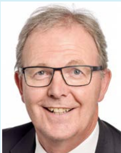
Axel VOSS Rapporteur