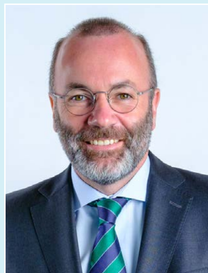
Manfred Weber MEP Chairman of the EPP Group in the European Parliament

I would like to say thank you to our EPP Group Members of the AIDA Committee who have successfully fought for a solid foundation to shape a future where AI benefits us all, prioritises ethical considerations and enhances the wellbeing of European citizens.