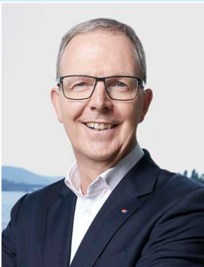
Axel Voss MEP Rapporteur