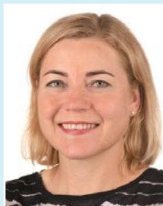
Henna VIRKKUNEN Substitute