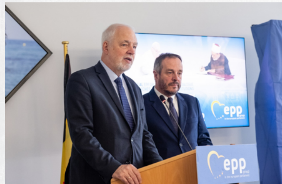
Jan Olbrycht MEP and György Hölvényi MEP, Co-Chairs of the EPP Group Working Group on Intercultural and Religious Dialogue

For further information about the conference please see the Brochure: “XXII Annual Intercultural Dialogue with Churches and Religious Institutions, Human Fraternity for World Peace and Living Together”, published by the EPP Group in the European Parliament.