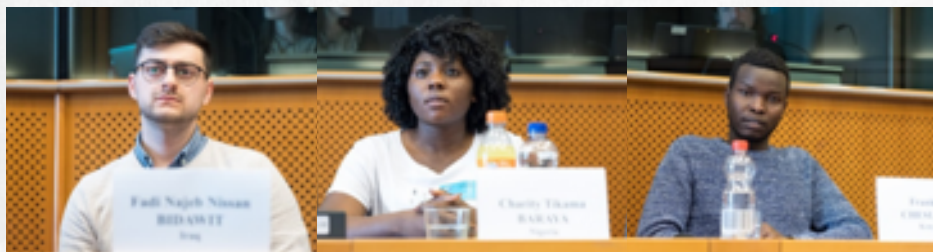
Students from Iraq, Nigeria and Kenya