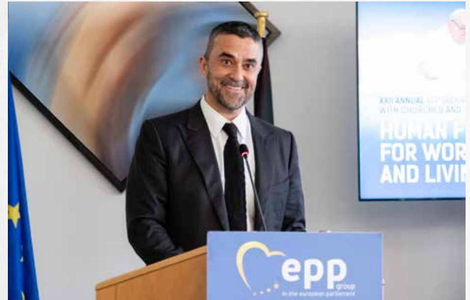
H.E. Omar Ghobash, Assistant Minister for Cultural Affairs at the UAE Ministry of Foreign Affairs and International Cooperation