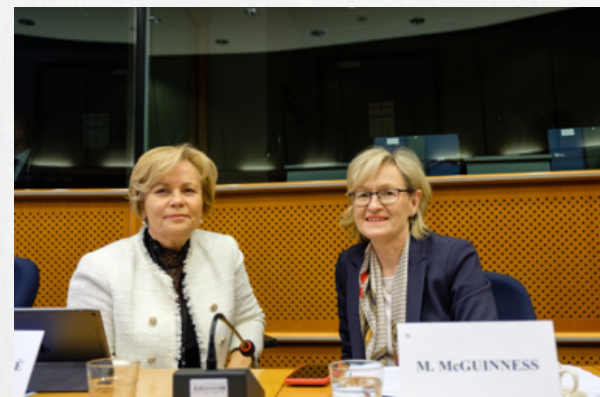
Rasa Juknevičienė MEP, Vice-Chair of the South Caucasus (Armenia, Azerbaijan and Georgia) Delegation; Mairead McGuinness First Vice-president of the European Parliament

It was the first time ever that such a delegation composed of all major churches and religious communities visited together Brussels.