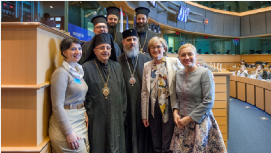
Mairead McGuinness MEP, First Vice-President of the European Parliament and Marijana Petir MEP with conference speakers and invited guests

Overall attention should be paid not only to short term-goals, but, to expand into long term-goals, including the reconstruction of the country (not only infrastructures, health care or education services but also economic life...) and ensuring a safe, "attractive" and viable environment for the returnees. In order to achieve this, stakeholders need to come up with practical solutions.